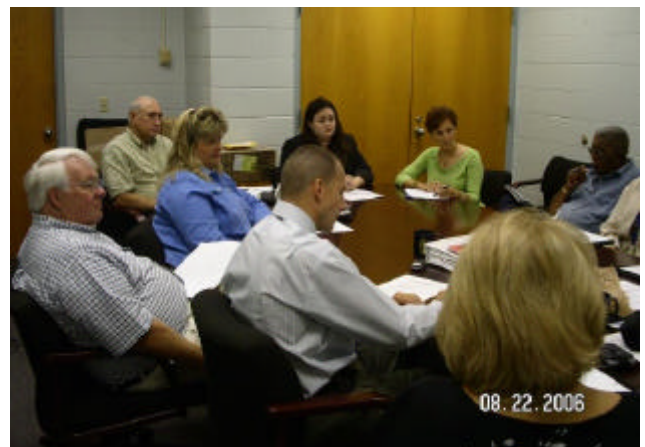
Tampa Bay Area Coalition Members and Guests